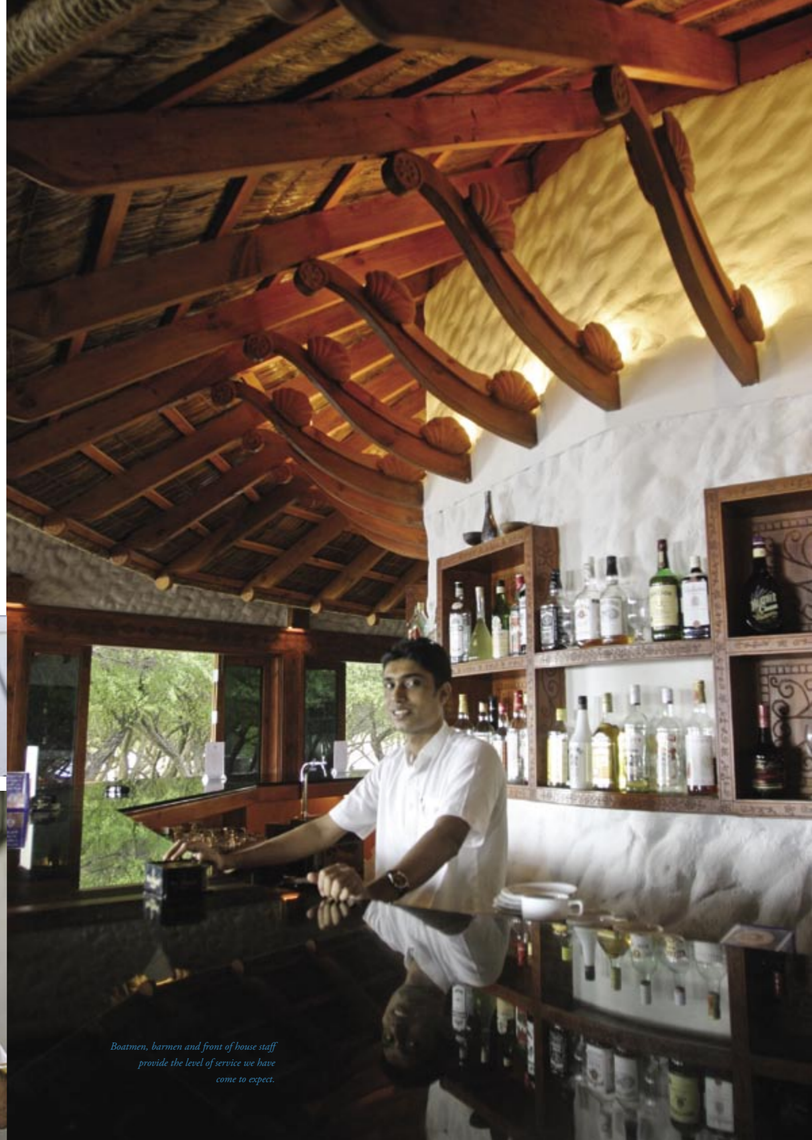
Boatmen, barmen and front of house staff provide the level of service we have come to expect.