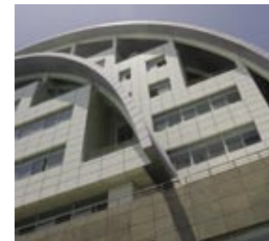
The daily grind of Malé - a reality check from resort life.

With its frenzied activity and densely settled population, Malé is in stark contrast to the idyllic tropic vistas of the Maldives atolls, but is well worth a half-day visit and is easily accessible from the Dhonveli Resort.